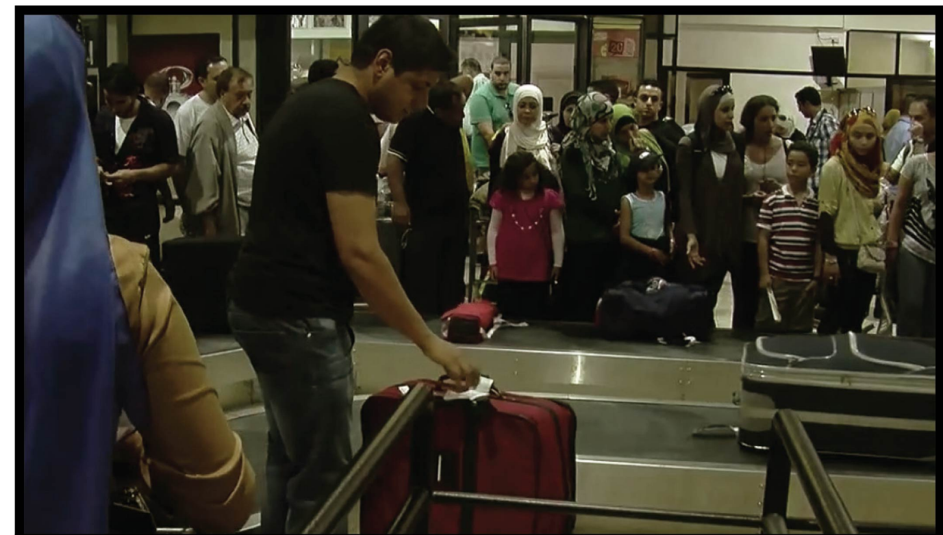
Passengers at Amman Civil Airports