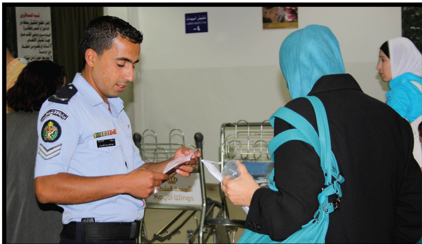
Airport Security checking passports

Amman Civil Airport Administration ensured staff readiness and coordiantion among all related entities to provide quality services to passengers and airlines during Eid Al-Fitr Holiday.